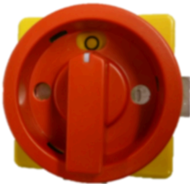
Figure 1: Main switch

The following safety devices are installed: